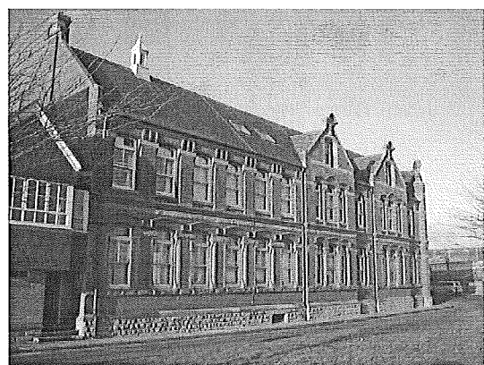
The Aveling & Porter Building, threatened with destruction