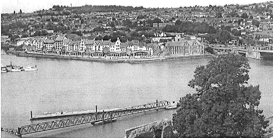
Strood's new quayside? Artist's impression by Huw Thomas, commissioned by SAVE

THREATENED BUILDING COULD TAKE PRIDE OF PLACE IN NEW DEVELOPMENT